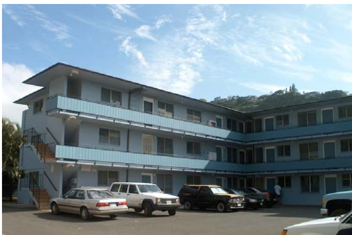
1841 A Palolo Ave.